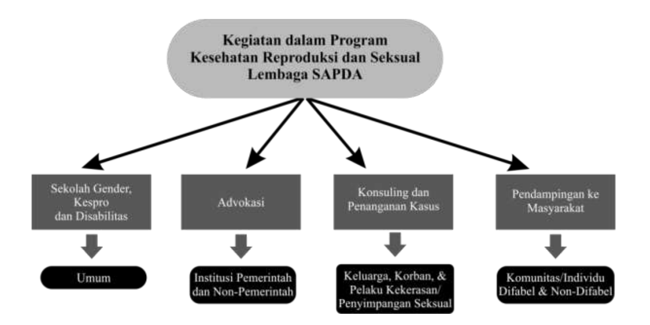
Figure 1. Activities in Sexual Reproductive Health Program by Sexual Reproductive Health (KesPro) Divison of SAPDA

reproductive health. (3) the activities of konsuling and the handlers of the case as an attempt to combat the problem of sexual and reproductive health. This more privacy between activity the victim/perpetrator or the family and its relatives with a team of KesPro SAPDA. (4) the activities of mentoring to both individuals and communities and is devoted to disabled teenagers, parents/ guardians, or teachers. As preventive efforts with small group socialization shapes using interpersonal communication. Material presented is adapted to disabled teenagers and more capabilities are basic.