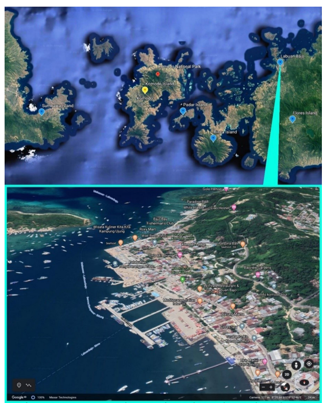
Figure 1. Komodo National Park and Labuan Bajo, East Nusa Tenggara

In the context of the tourism industry, Ying et al. (2014) have found that links to other websites that also support the tourism business in the US improve the connectivity of corresponding businesses by fulfilling consumers' needs for information. A similar indication is also found by Ingram & Roberts (2000), that information exchange among hotel managers in Australia, including among competitors, increases the revenue of hotels, particularly during the low seasons.